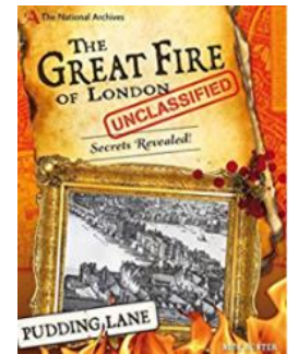
The Great Fire of London Unclassified: Secrets Revealed! (Nick Hunter)