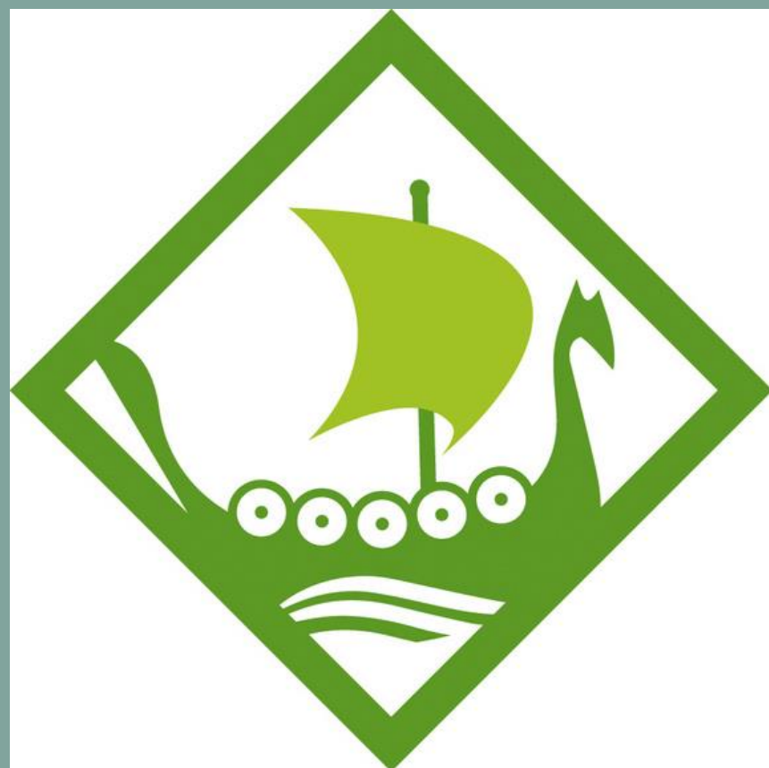
Knockhall Primary School