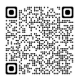
Escalation Process – minimum expectations